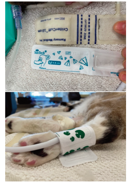
Top: Cuffs showing optimal zones Bottom: Proper cuff placement