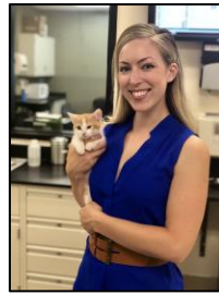
Laurel Krause Clinical Research Scientist Scholarship