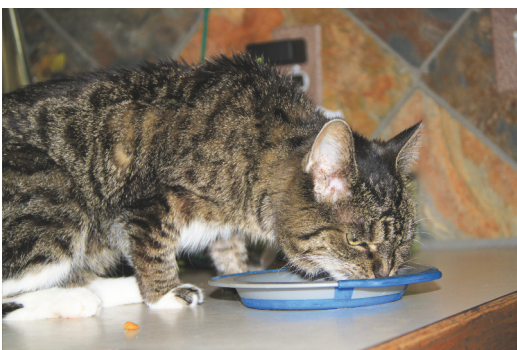
Figure 10 Muscle wasting and dehydration in a cat with CKD. Careful attention to body condition, muscle mass and caloric intake is important.