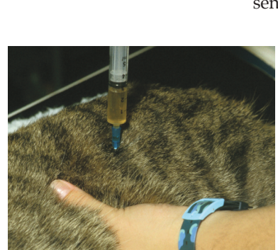
Figure 4 Collection of a urine sample by lateral cystocentesis for routine monitoring of CKD.

The gold standard in renal function testing is direct determination of GFR. Limited- and single-sample plasma clearance methods (eg, using iohexol, inulin, exogenous creatinine or radiolabelled markers) have made GFR assessment easier to undertake in clinical practice, but the reduced numbers of blood samples may yield greater inaccuracy.<sup>21,28</sup> Clinical measurement of GFR is mainly used to confirm suspected CKD in non-azotaemic cats.