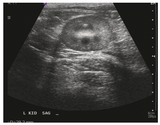
Figure 6 A small kidney and loss of corticomedullary distinction are ultrasound findings consistent with feline CKD.

Studies have demonstrated that development of renal secondary hyperparathyroidism<sup>34</sup> and increased fibroblastic growth