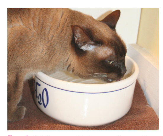
Figure 8 Multiple sources of fresh water are important for maintaining hydration.

dehydration is a concern, but it is important to ensure intake of other nutrients is maintained.49