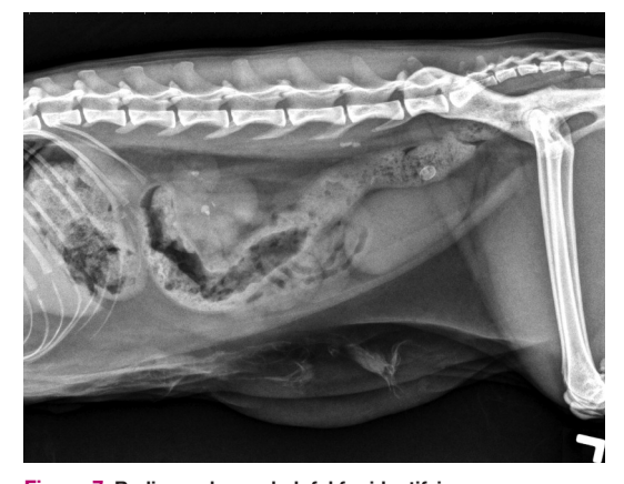
Figure 7 Radiographs are helpful for identifying abnormalities such as stones within the urinary tract.

factor-23 (FGF-23)<sup>35</sup> may precede azotaemia in feline CKD. However, whether there is any diagnostic utility in these assays remains to be determined.